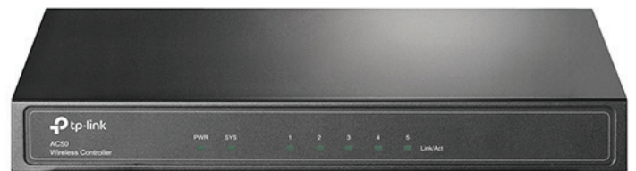
Wi-Fi controller AC50

Separate authentication has also been implemented for the staff and patients, which is required according to the Decree of the Russian Government.