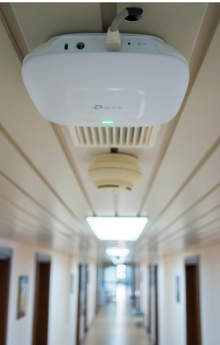
Installed Wi-Fi access point in the unit of Regional Hospital No. 1

It was decided to use the following TP-Link equipment: Wi-Fi controller AC50, which allows to centrally manage and monitor all the access points in the hospital and the APs CAP1200, providing the Wi-Fi network coverage in set with the controller.