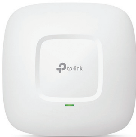
Gigabit Ceiling mount CAP1200

The Fast roaming technology should also be noted – it allowed the medical staff to switch automatically between the access points with the best signal when examining patients in different hospital wards. MU-MIMO technology provided data transfer rates of up to 1200 Mbps simultaneously to multiple users.